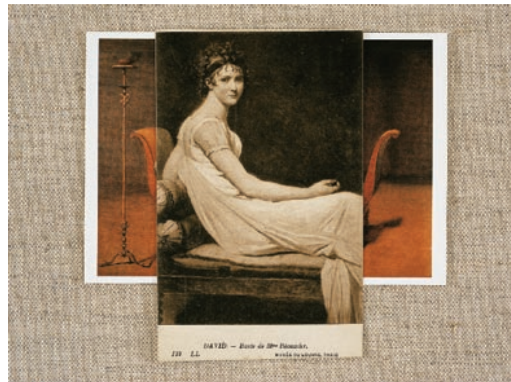
Next page: Untitled (Madame Récamier), 1996

Exhibition view of " The Last Who Speaks " at Frac Champagne-Ardenne, Reims, 2008